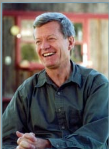
Max Baucus U.S. Senator maxbaucus2008.com