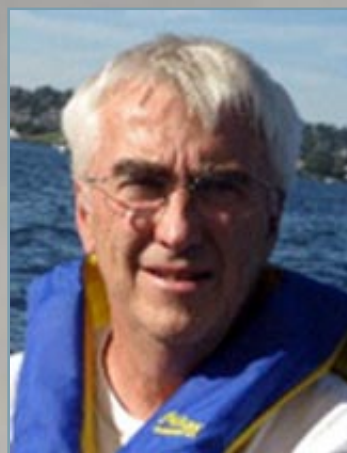
John Driscoll U.S. Congress change-congress.org