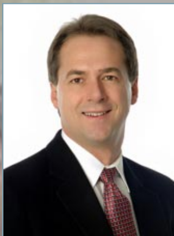
Steve Bullock Attorney General SteveBullock.com