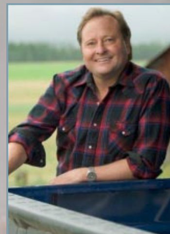
Brian Schweitzer Governor BrianSchweitzer.com